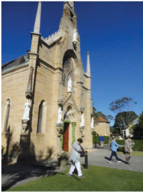
Villa Maria Church