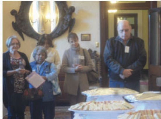
Lunch at Joeys