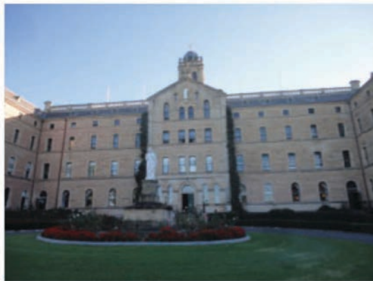
St Joseph's College