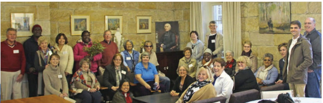
Our pilgrimage group at the Marist Fathers dining room Hunters Hill

Anyone who has worked in loneliness, with great adaptation required and with little apparent success, will find a kindred spirit in Peter Chanel. A timely reminder for us that what looks like failure is but a building block in God's hands.