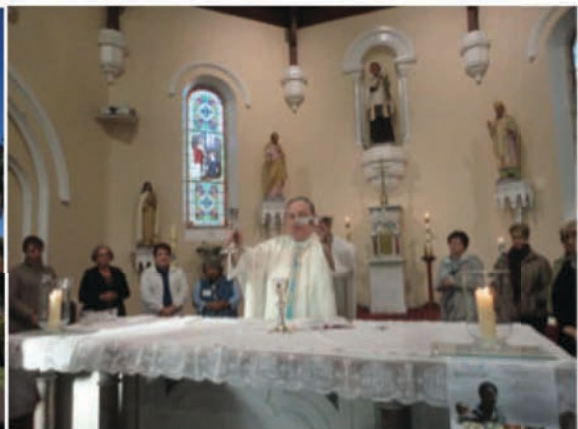
Mass at St Peter Chanel Church