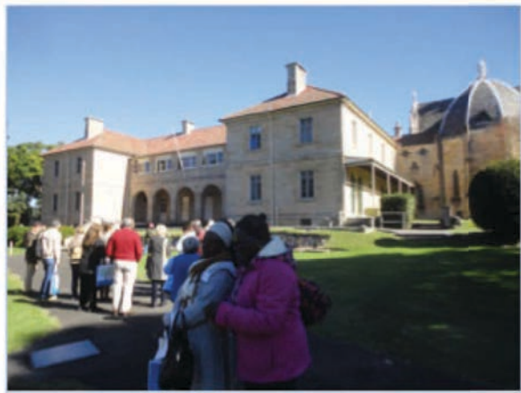
The Marist Monastery Hunters Hill