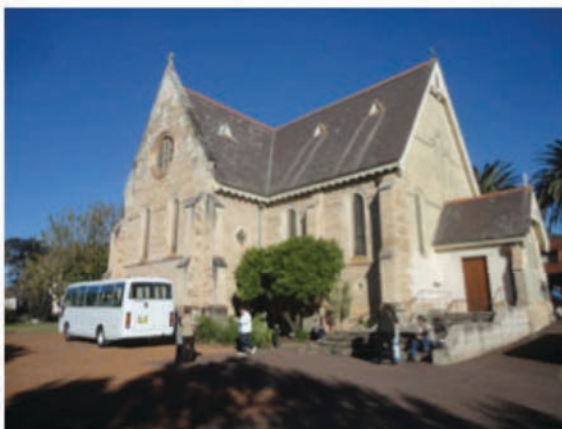
St Peter Chanel tour